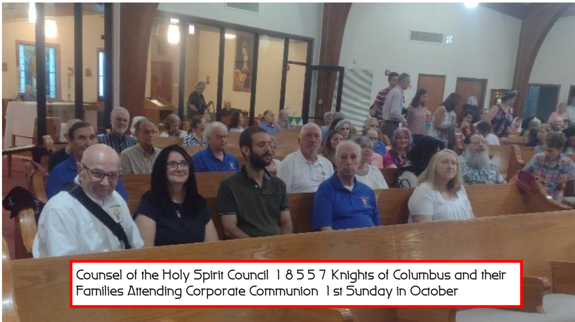
Counsel of the Holy Spirit Council 18557 Knights of Columbus and their Families Attending Corporate Communion 1st Sunday in October